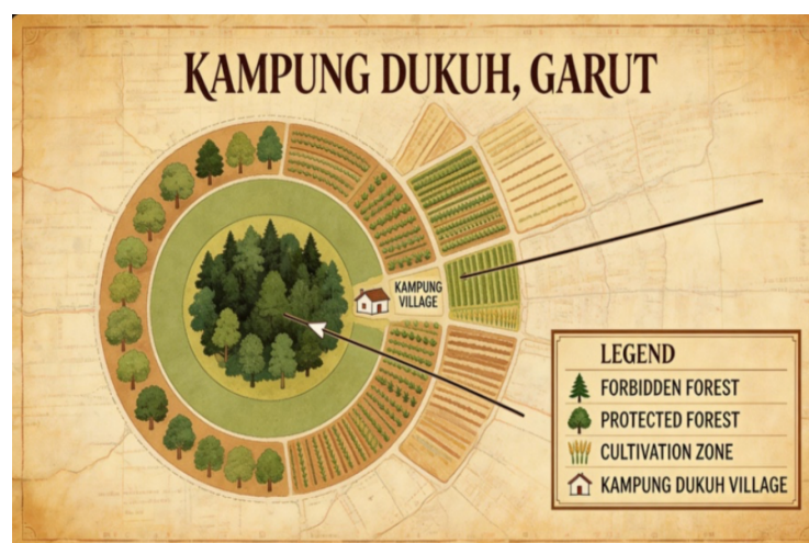
Figure 2. Kampung Dukuh, Garut

Religious life integrates Islam with pre-Islamic adat, forming a coherent symbolic system. Customary forest regulations derive dual authority from syariat and adat, reinforced by ancestral piety. The Ngabukti ritual at the sacred grave in leuweung larangan reaffirms prohibitions, while Muludan involves sourcing offerings from designated zones with youth instruction. These rituals create collective effervescence (Durkheim, 1995), transmitting the spatial logic of zoning as inseparable from religious observance. From a cultural ecology perspective, the Dukuh zoning system validated by Islamic and ancestral authority constitutes a cultural core that regulates resource utilization. Ritual functions as a mechanism for ecological governance (Rappaport, 1968), with the kuncen embodying charismatic authority (Weber, 1978). Informants associated forest prohibitions with spiritual and material consequences: “If [the forbidden forest] is damaged, harvests fail, illness comes” (elder). Youth primarily learn rules through ritual contexts, such as Ngabukti, where elders reinforce prohibitions. This transmission operates through habitus (Bourdieu, 1977), as youth internalize values via repeated practices, for example, collecting leaves from leuweung titipan during Muludan under elder supervision, thereby embedding ecological knowledge within a framework of spiritual accountability.